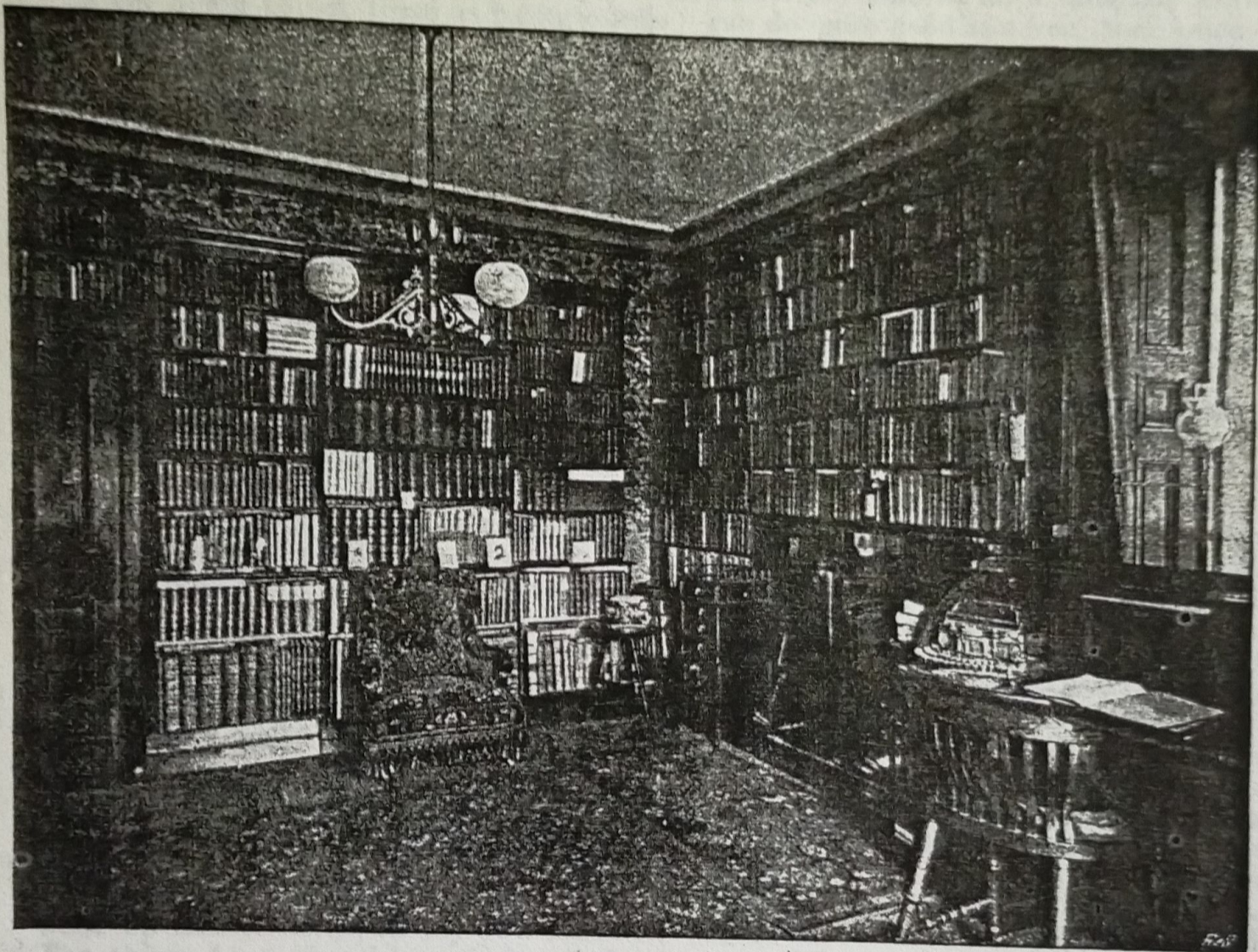
MR. CROCKETT'S LIBRARY.