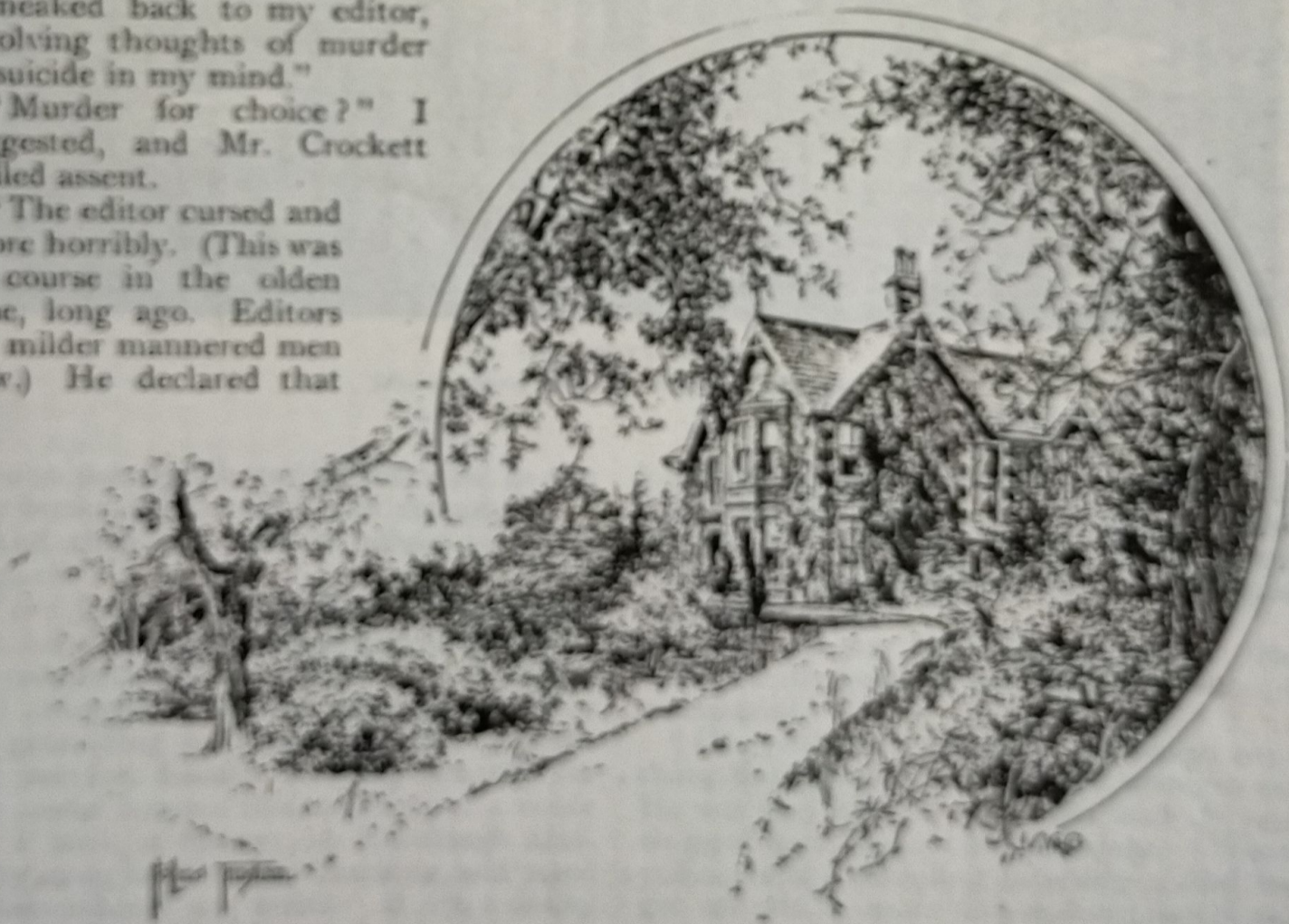
MR. CROCKETT'S HOUSE.

"Why, the most important influences in it were these, so far as one can indicate the facts of a dozen years in a few sentences. First, I should count the extreme strictness of our education. The Cameronians were the theological aristocracy of the Galloway countryside, so to speak; and the two or three families of whom we consisted mixed little with the laxer brethren round about. Amusements were almost all tabooed: to this day I find it difficult not to look on cards, for instance, as sinful. Besides, I can't play. Even 'light literature' was not allowed, and I had to read Scott and Shakespeare on the sly. I told you once before how the late Professor Clerk Maxwell found me lying on the muir and reading Shakespeare, and gave me two half-crowns in reward of my good